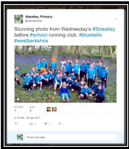
Photo from running club among the bluebells.