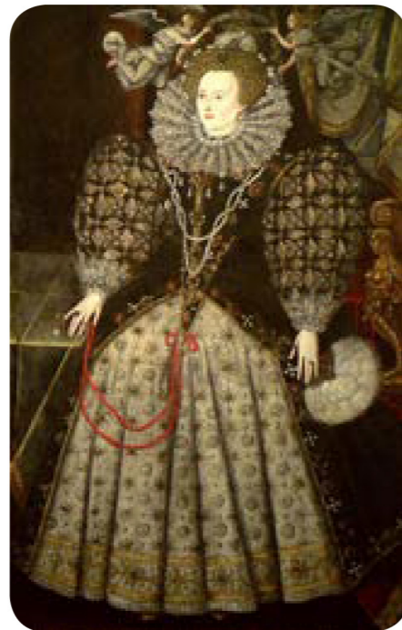
Portrait of Elizabeth I of England attributed to Nicholas Hilliard, 1590