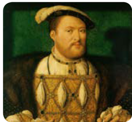
Portrait of Henry VIII by Joos van Cleve, c1530–1535

A portrait is a painting or photograph of a person. It usually shows their head and shoulders, but may show their whole body. Before cameras were invented, kings and queens often had official portraits painted to show how powerful and important they were.