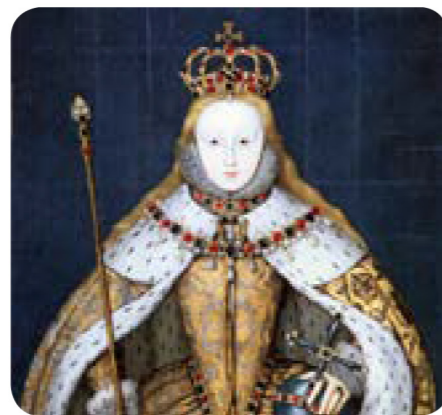
Coronation Portrait by unknown artist, c1600