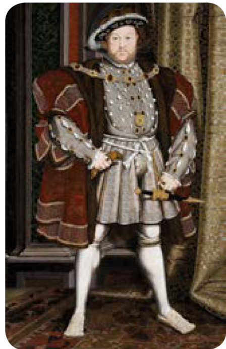
Henry VIII by Hans Holbein the Younger, 1537–47