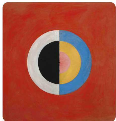
This painting, by Hilma af Klint, is called The Swan No. 17 . The subject matter has been reduced to pure shape and colour. Without knowing the title of the piece, the viewer would not know that the painting represents a swan.

Abstract art takes recognisable objects or forms and changes them until they no longer look realistic. Abstract art allows artists to freely communicate their ideas in a way that is not limited by reality. The artist may leave out details, change the point of view, exaggerate the size, distort the shapes and colours or twist and simplify forms.