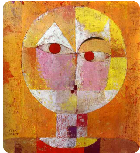
This painting, by Paul Klee, is called Senecio (Old Man) . The shape and colour of the face have been distorted, but it is still recognisable as a face.

In the art world, the term distortion is used to describe any change made by an artist to the shape, size or visual character of a form to express an idea, convey a feeling or enhance visual impact.