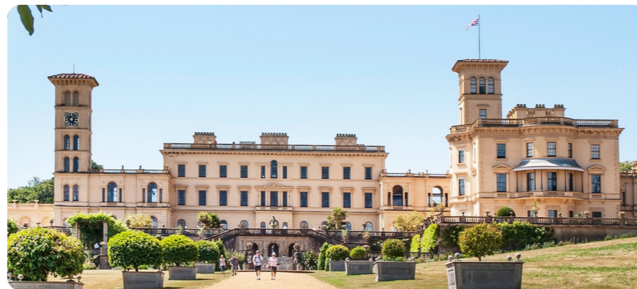
Osborne House is on the Isle of Wight, England.