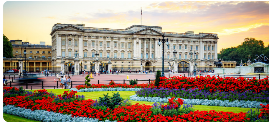
Buckingham Palace is in London, England.

Royal residences include palaces, castles and stately homes. Some of them are used for official royal business. Some are used as holiday or private homes. Many are tourist attractions.