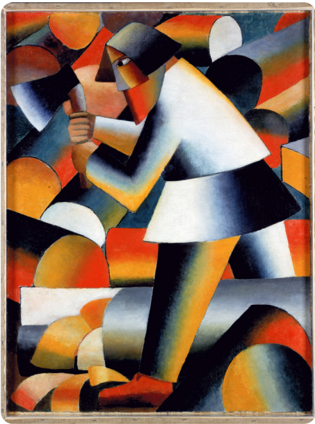
Some artworks reduce their subject matter to basic shapes, such as The Woodcutter by Kazimir Malevich.