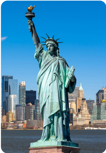
Statue of Liberty (Liberty Enlightening the World)

A statue is a three-dimensional representation of a person, animal or mythical being. It is usually the same size as the person or animal in real life or much larger. Most statues are displayed outdoors, so artists make them from durable materials, including stone or metal, such as marble or bronze.