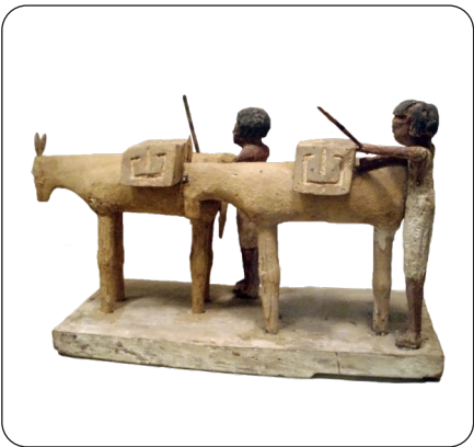
Ancient Egyptian figurines

The making of statues, statuettes and figurines is an ancient craft. It was an important part of the culture of past civilisations, including ancient Sumer, ancient Egypt and the Indus Valley. The sculptures made by these civilisations include important people, such as monarchs and religious deities. They also tell us about the everyday lives of the people who were part of these ancient civilisations and the things that were important to them.